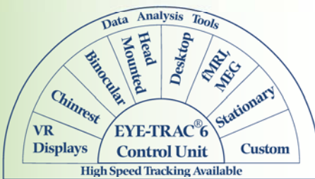
*All eye camera optics are configurable with control unit

D6-HS optics are portable and can be configured with a laptop as well as a PC.